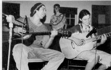
Farm youth group, Tofu Nation, unplugged.