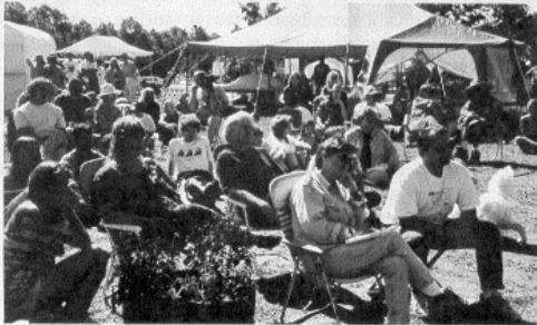
Listening to a speaker at one of the workshops.