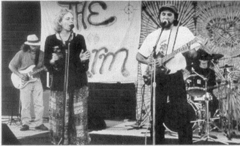
The band "Common Bond" expresses a Festival theme.

The Festival was attended by more than 700 folks who were treated to world beat music, workshops, vegetarian cuisine and beautiful Tennessee fall weather, sunny and warm by day, cool, clear nights under a full moon. It was an educational, healing, musical, 'fun-raiser.'