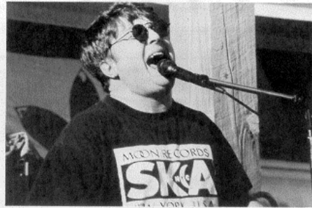
a.k.a. RUDY served up some irresistible SKA.