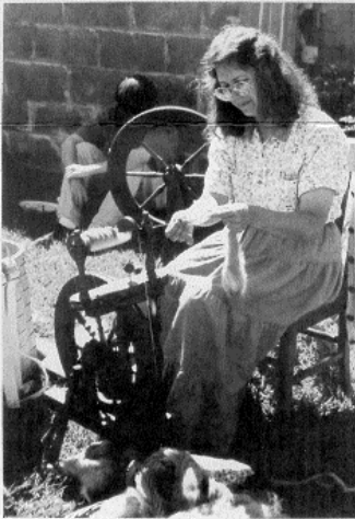
Demonstration of an appropriate technology, spinning wool. 3