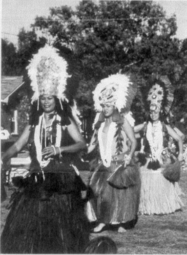
The Polynesian Reflections have become Festival favorites.

The Harvest Festival took place September 27-29, 1996. A benefit for Plenty's Kids to the Country project, the Festival also marked the Farm Community's 25th Anniversary. It was 25 years ago, September, 1971, that 270 hippie pioneers in 50 some "bus-homes" landed here.